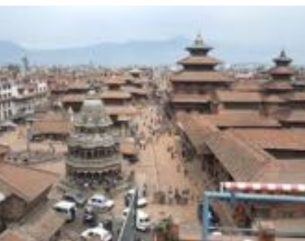
PHOTOS L: First FR steering committee meeting in Nepal R: Kathmandu, Nepal