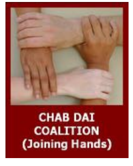
Our first logo in 2005