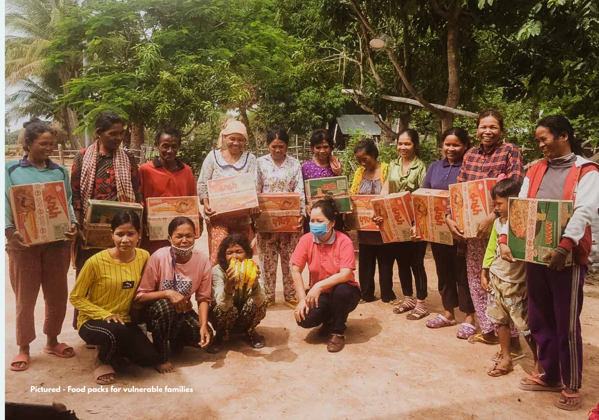
Pictured - Food packs for vulnerable families

156 Global Learning Community Members from 37 countries