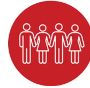
Pictured - Community training in the province

Families, neighbors and communities are empowered to protect and ensure the safety of one another with the support of NGOs, influencers, local authorities, religious leaders and government.