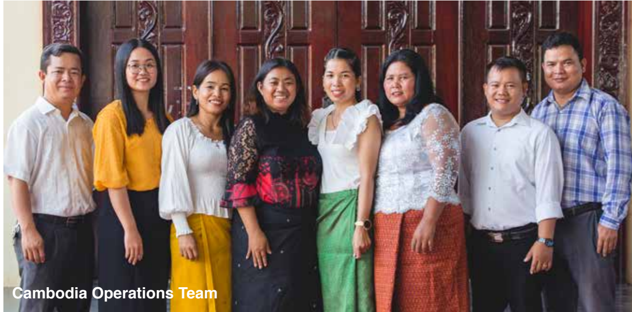
Cambodia Operations Team