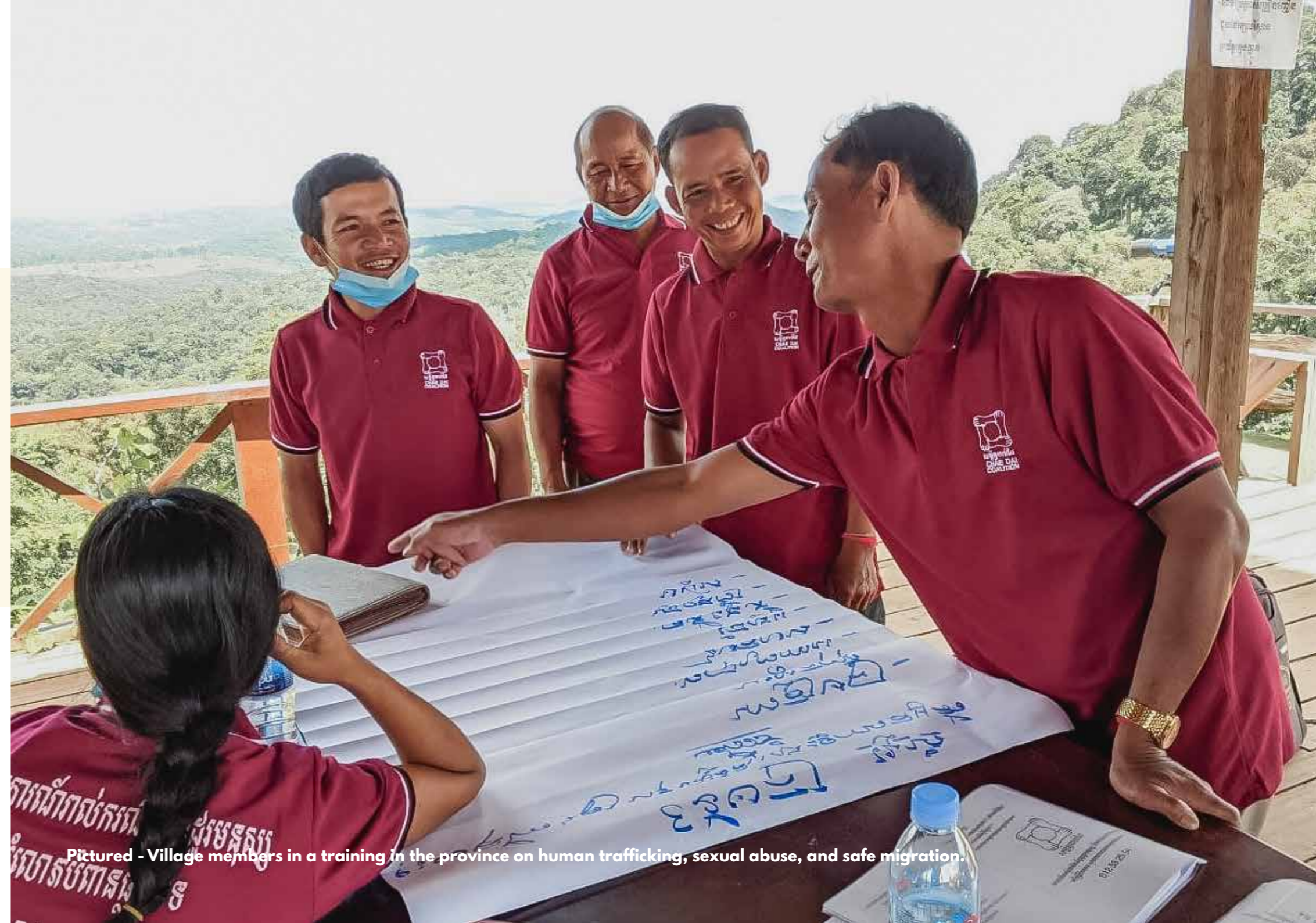
Pictured - Village members in a training in the province on human trafficking, sexual abuse, and safe migration.